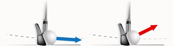
Attack Angle: the up/down movement of the club head's geometric centre at the time of maximum compression