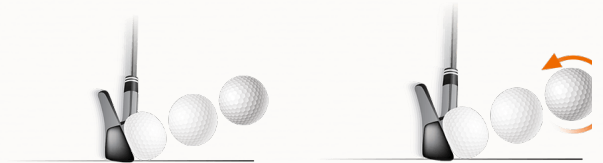
Ball Speed: the speed of the golf ball's centre of gravity immediately after separation from the club face.

All major companies with no exceptions, use and trust Trackman for two reasons; the reliability of the data and the precision of it. The radar is able to accurately measure both indoor and out, the landing position of a shot with an accuracy of less than 1 foot from 100 yards. Each shot is displayed using the shot's 3D trajectory as well as the ability to highlight any of the 26 different impact and ball flight parameters within 1 second of being hit.