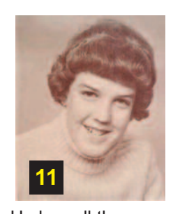
He has all the gear.