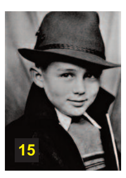
An aimless rebel