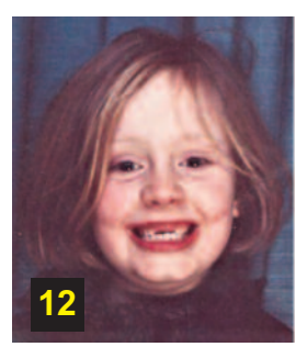
A Bond girl - sort of.