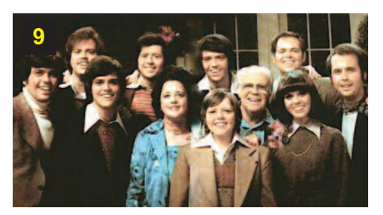
Numbers 8-10 Name the Family Just the surname