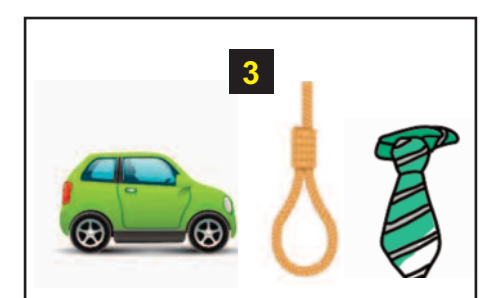
Numbers 1-7 are all Golf Courses ranked in the World Top 100